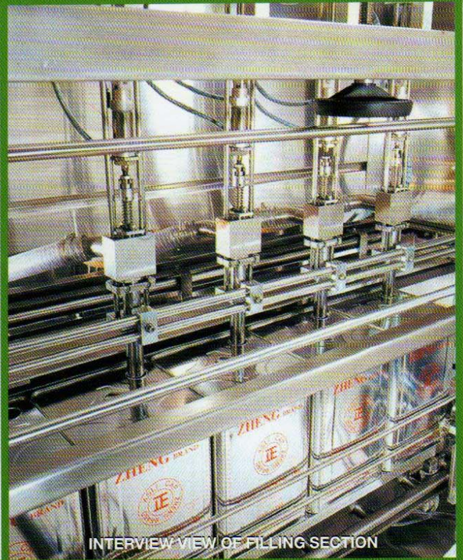
INTERVIEW VIEW OF FILLING SECTION